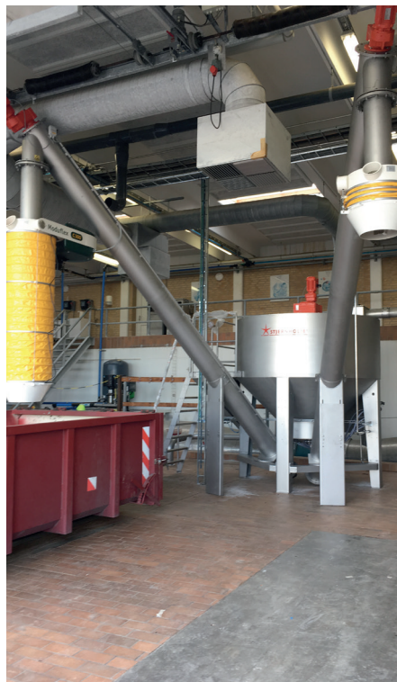
By the addition of a second screw conveyor, the sand output capacity increases to 3 tons/h per sand washer.