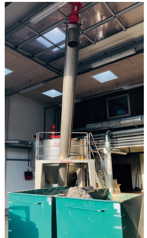
The washed sand is dried by gravity while conveyed directly to a container – ready for transportation and reuse.