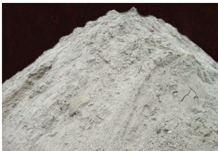
The sand final output contains less than 3% organics and 5% water.