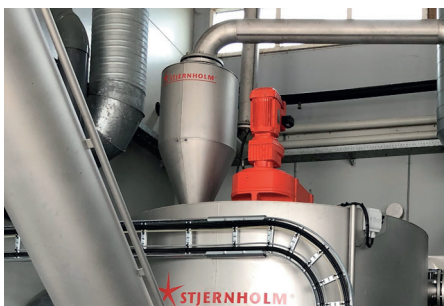
Capacity of the sand washer can be increased by mounting a cyclone at the inlet.