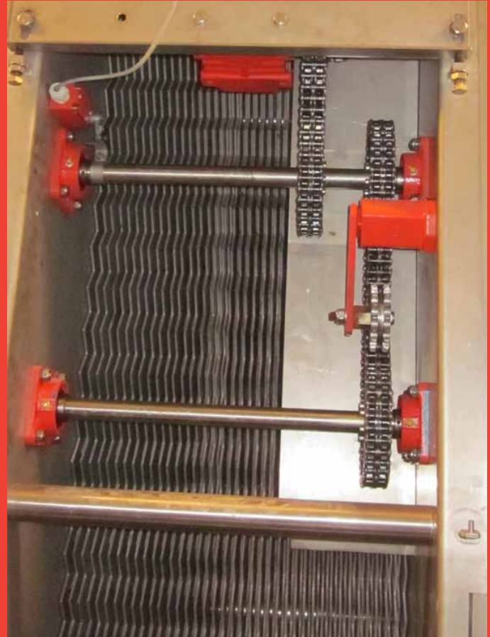
The Mechanical Fine Screen from Stjernholm features a solid construction and is run by a low-energy engine through a worm gear and a driving gear. The parallel screen bars, which are alternately fixated and moveable, ensure minimal crack openings in all operational situations.

The screen absorbs up to 40% of the screen material and this performance is secured through minimal crack openings by the screen bars and highly reliable operations.