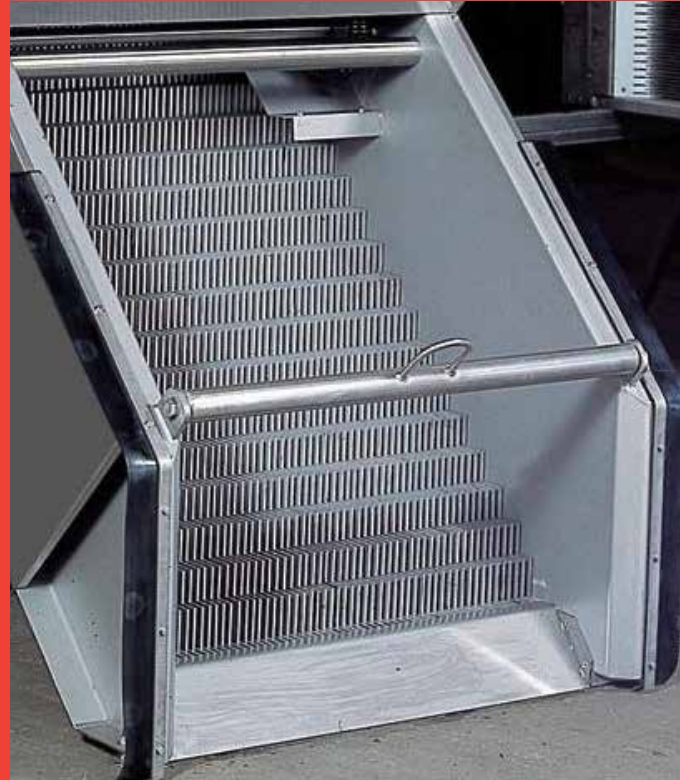
The screen has a very low front edge by the bottom that eliminates the risk of stagnant water and thus sedimentation before the screen.

During the past 25 years, the Mechanical Fine Screen from Stjernholm has been installed in numerous places in order to separate screen materials under various circumstances, and it can easily be adjusted to fit existing piping and buildings.